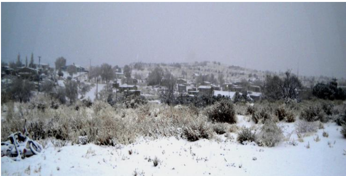
Bacavi, December, 2009